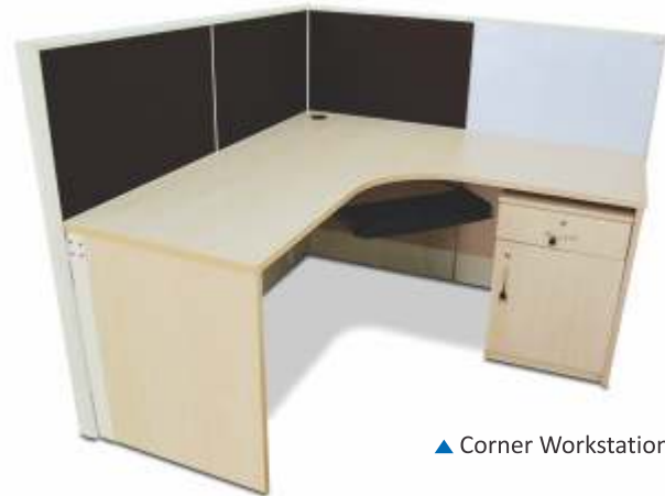
▲ Corner Workstation