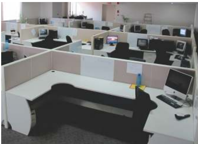
◀ CRCA frames of 1200mm height and 75 mm thick