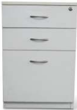
◀ Three drawer prelam pedestal (2B + 1F)