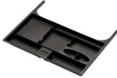
Stationery Organizer ▲