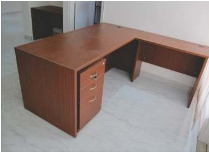
◀ Two piece manager table and three drawer prelam pedestal