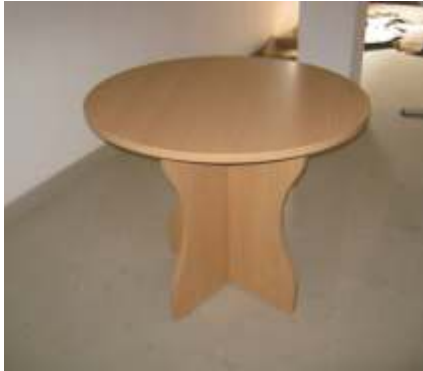
Prelam round table