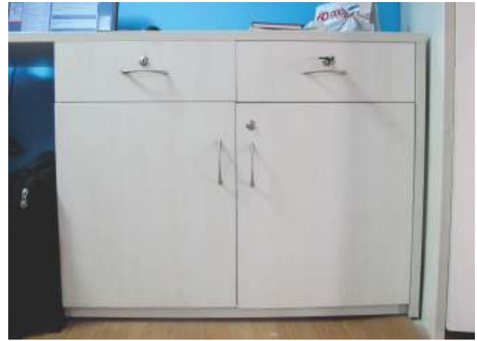
▲ Manager side storage, with two drawers above and two openable doors below