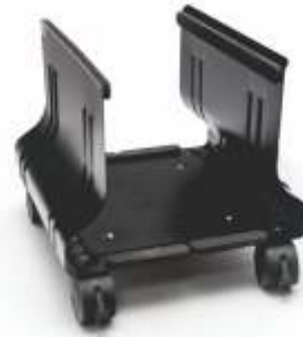
Metallic CPU Tray ▲