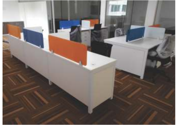
Workstation with side glass marker ▶