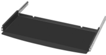
Metallic Keyboard Tray ▲