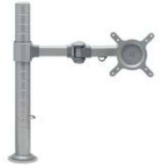
Single Screen Monitor Arm ▲