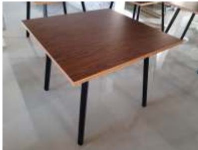
Cafeteria table for four seater