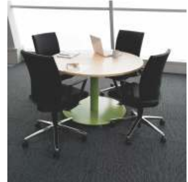
Prelam round table with Steel round base