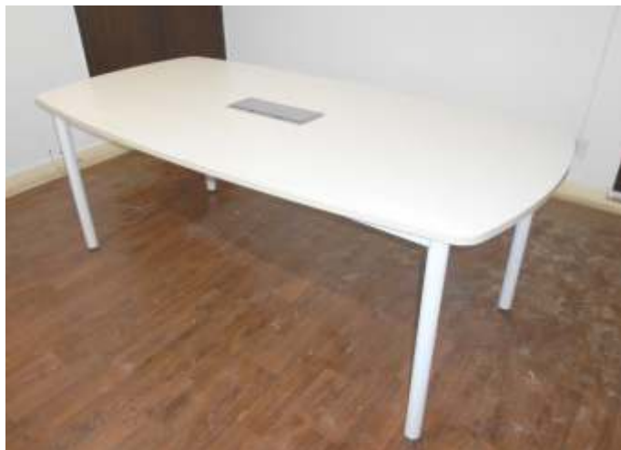
◀ Prelam table with steel leg support and power docket