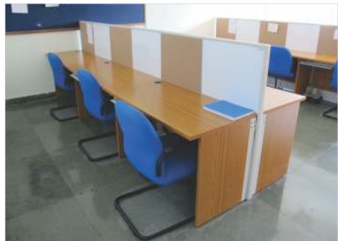
75 mm thick partition with one marker ▶ and soft pinup. Size is 1200 X 600mm