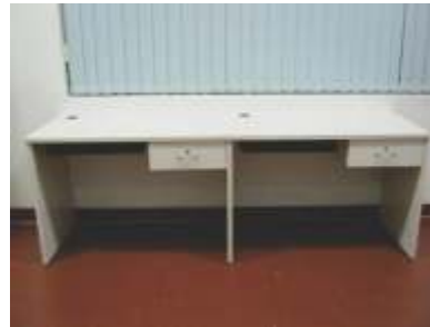
Free standing table with Keyboard tray and single drawer