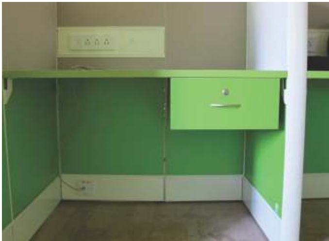
◀ Prelam single drawer