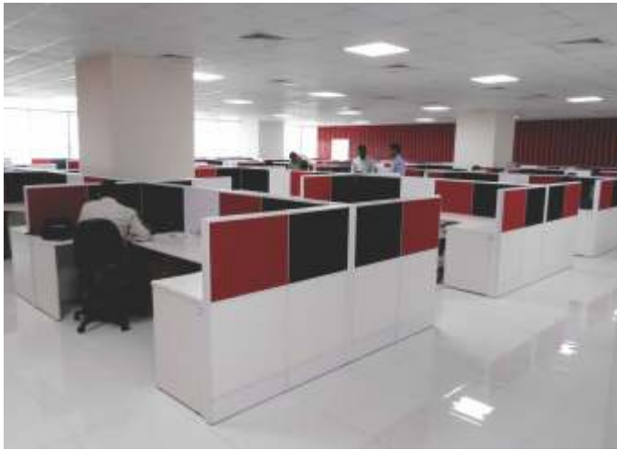
◀ Corner workstations with marker and pinup.