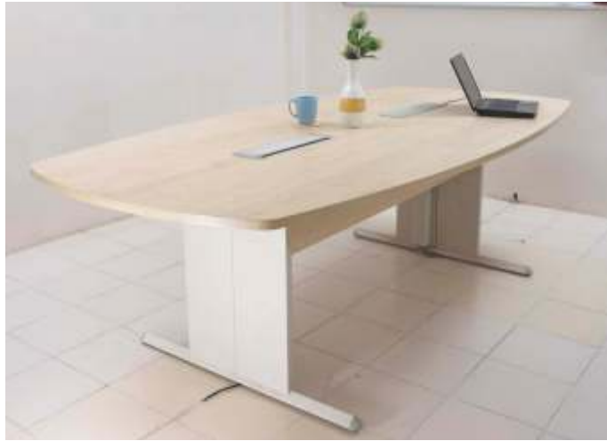
◀ Prelam table with steel leg support and access flap only