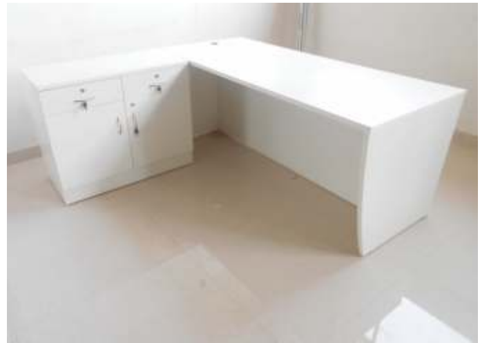
Prelam table with side manager storage ▶