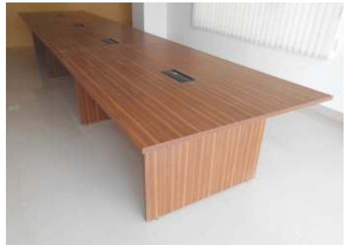
Prelam table with wooden understructure and power docket ▶