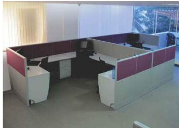
Pre lam corner table of size 1500 X 1500mm ▶ and 50mm thick partition