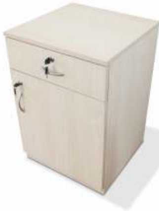
◀ Two drawer pedestal with one drawer above and open able door below (1B + 1F)