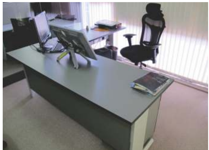
Table with steel legs support ▶