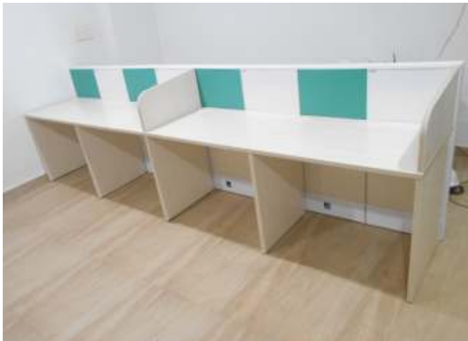
◀ Workstation with Prelam dividers