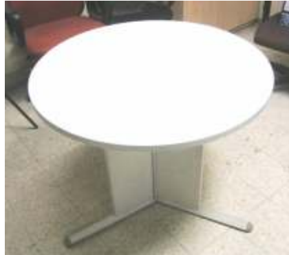
Prelam round table with steel legs