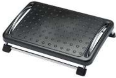
Foot Rest ▲