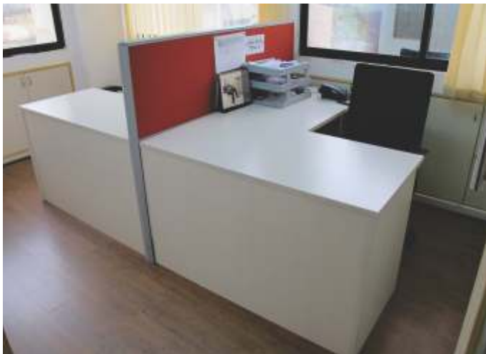
◀ Partition of 75mm thick between two manager tables