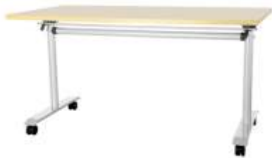
Folding Table ▲