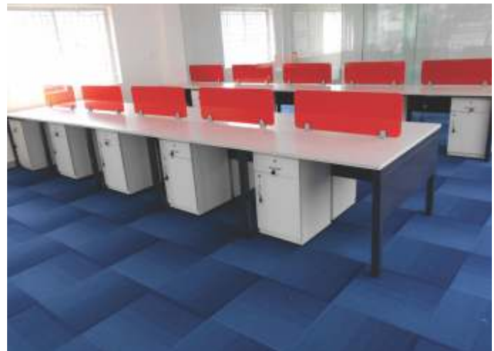
Workstation with side steel modesty ▶