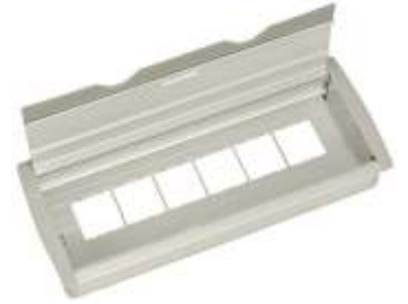
Access Flab 12 Module ▲