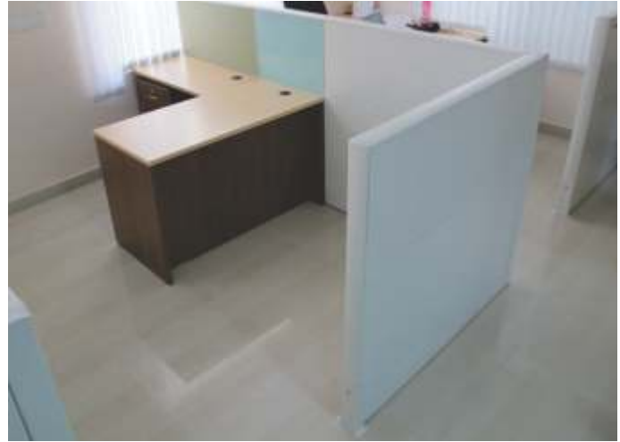
Half height manager cubicle ▶