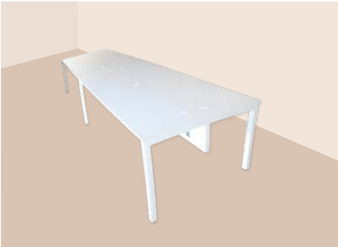
◀ Workstation with Steel understructure