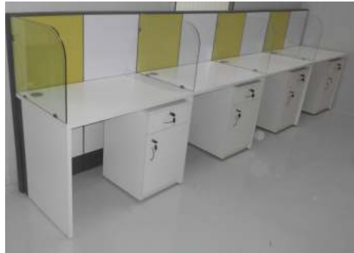
Workstation with glass dividers ▶