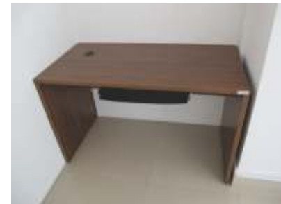
Free standing table with keyboard tray