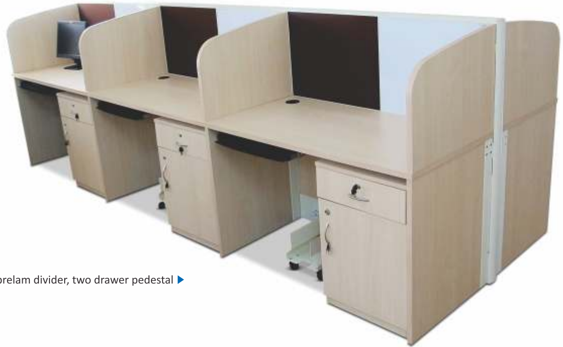
Back to back workstation with prelam divider, two drawer pedestal ▶ keyboard tray and CPU trolley