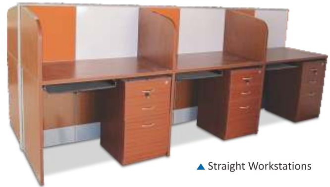
▲ Straight Workstations

To provide best office furniture system solution and strive continuously to provide excellent service to our customers. Smart Desk with its professionalism is easy company to do business in office furniture.