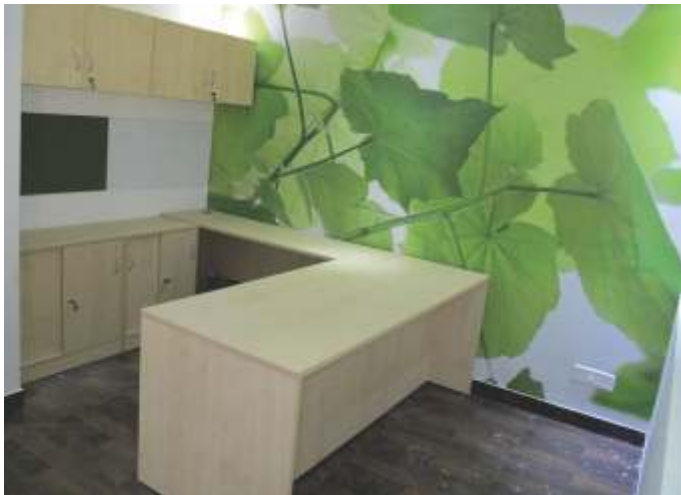
◀ Cabin two piece table with back credenza and marker and pinup board